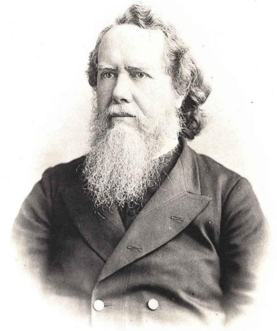
Hudson Taylor 1832 - 1905

Hudson Taylor famously said: Satan may build a hedge about us and fence us in and hinder our movements, but he cannot roof us in and prevent our looking up.